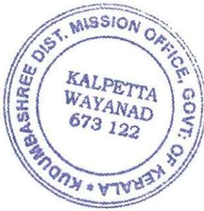
District Mission Co-ordinator, Kudumbashree,Wayanad.