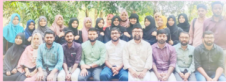
P G Student of NIA College, Kadavathur Visited Department on 12th March 2022