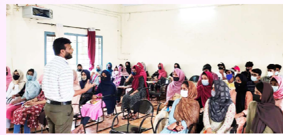
Department conducted "HORIZON 2k21" five Day Induction program for freshers from 2021 November 5-9.