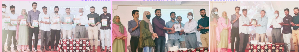
Peer Reviewed Research journal "Raihan" with ISSN, Department magazine "Annabla" and Arabic journal Al-Ahlam released on the eve of International Arabic Day Celebration.