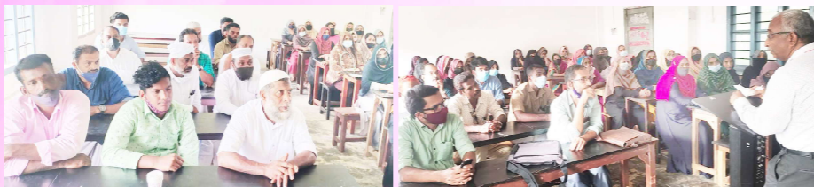
PTA Meeting of Second, First year on December 27, 2021, March 23, 2022 respectively