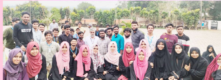
Students of MUA College Pulikkal on their visit on 24th March 2022