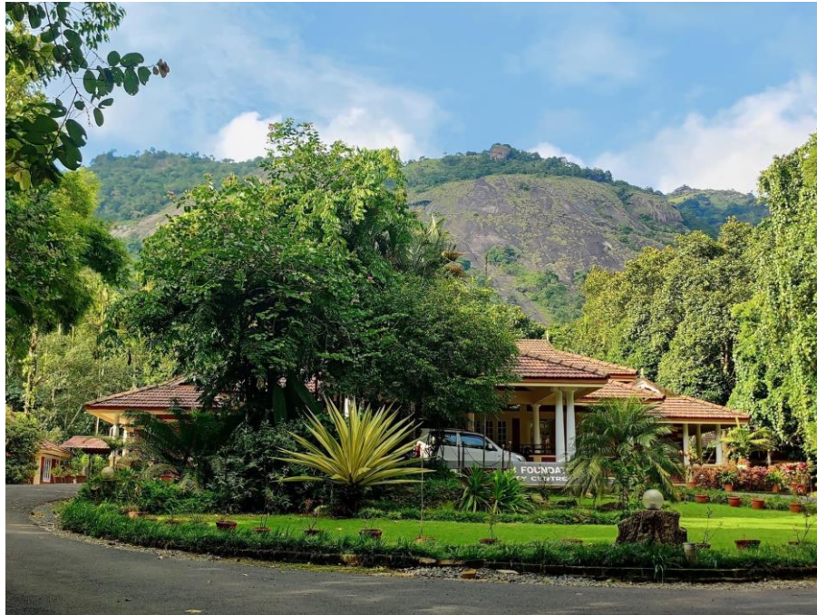
M S Swaminathan Research Foundation(MSSRF),Puthoorvayal,Wayanad