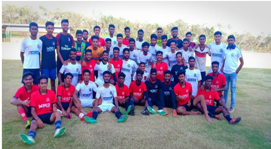
FRIENDLY MATCH BETWEEN DEAVGIRI COLLEGE AND W.M.O COLEGE