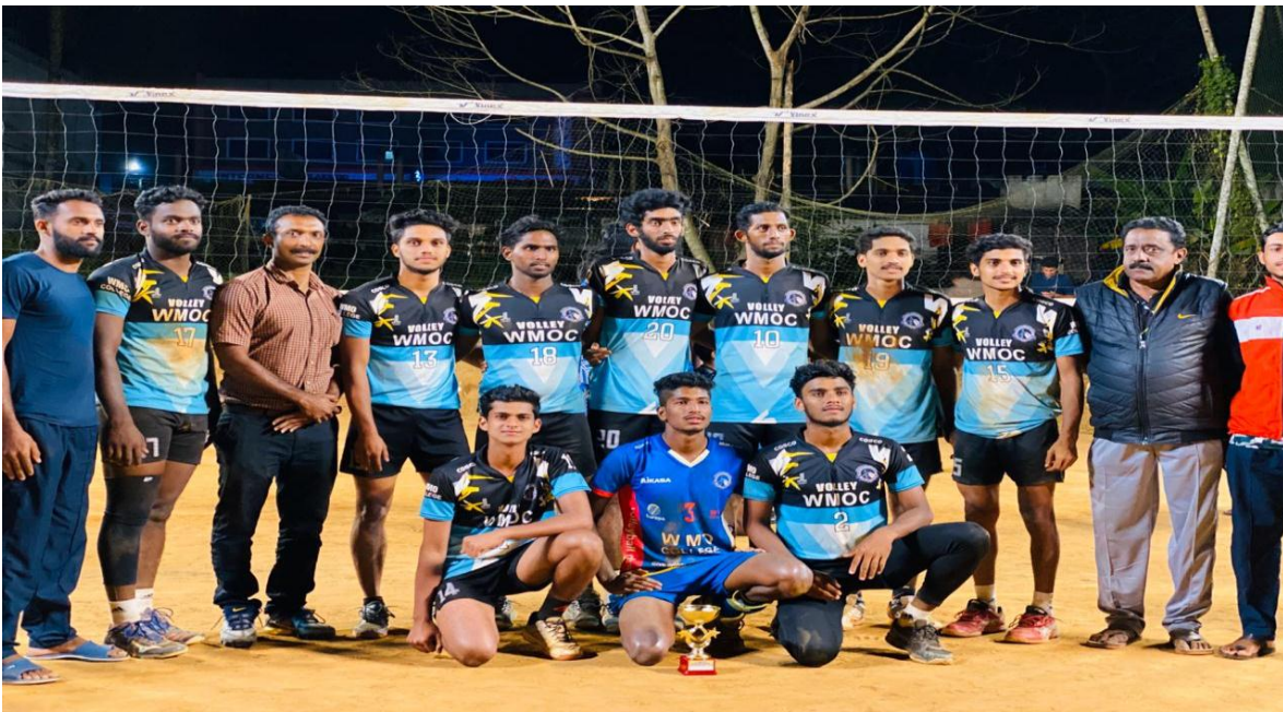
2020-21 COLLEGE VOLLEYBALL TEAM (INTERZONE)