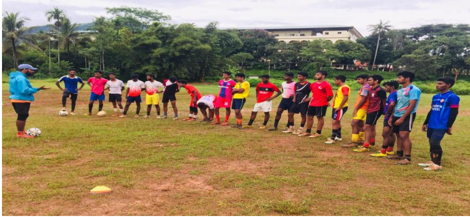
MORNING SESSION CAMP