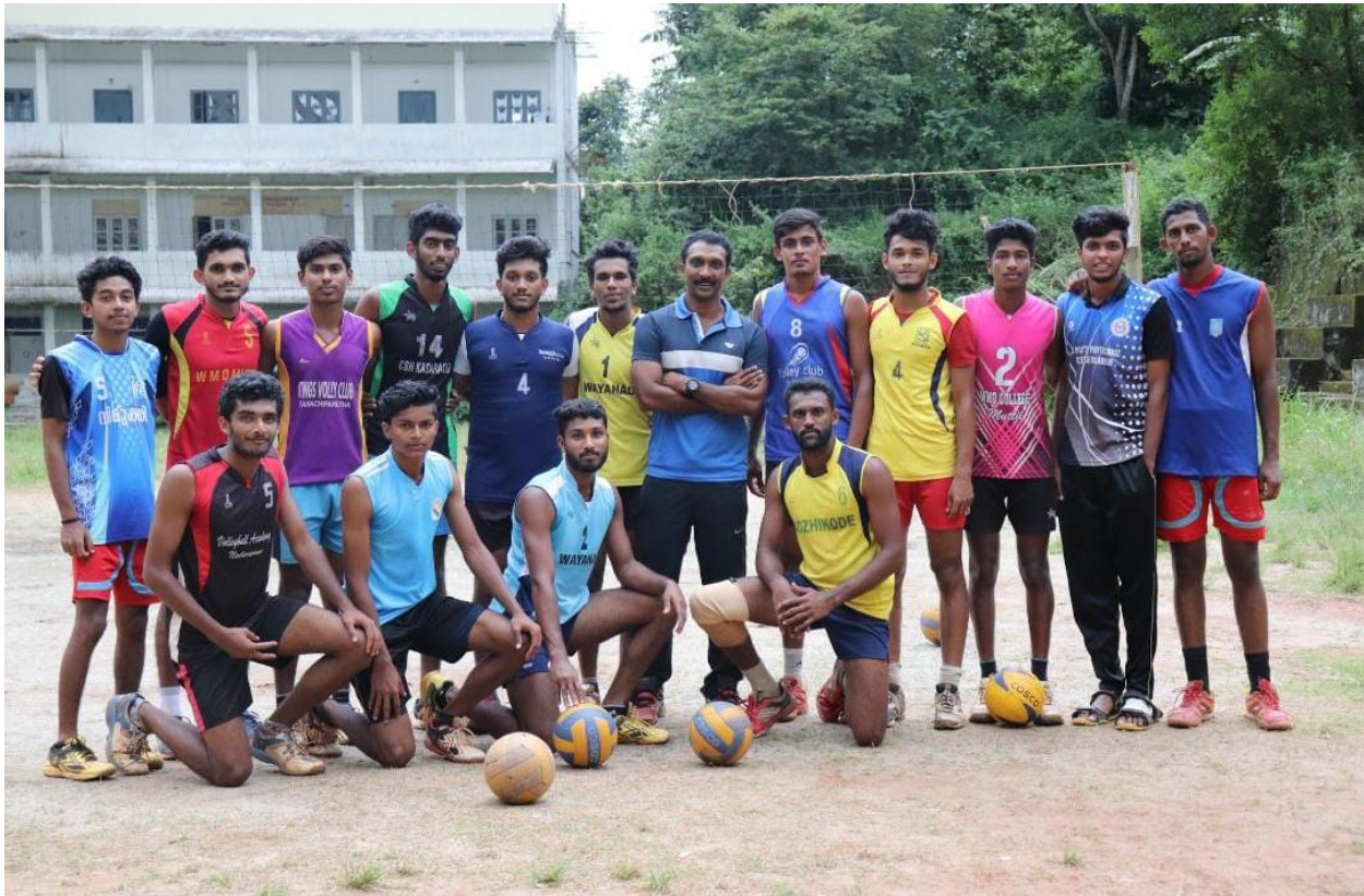
COLLEGE VOLLEYBALL TEAM 2017-18