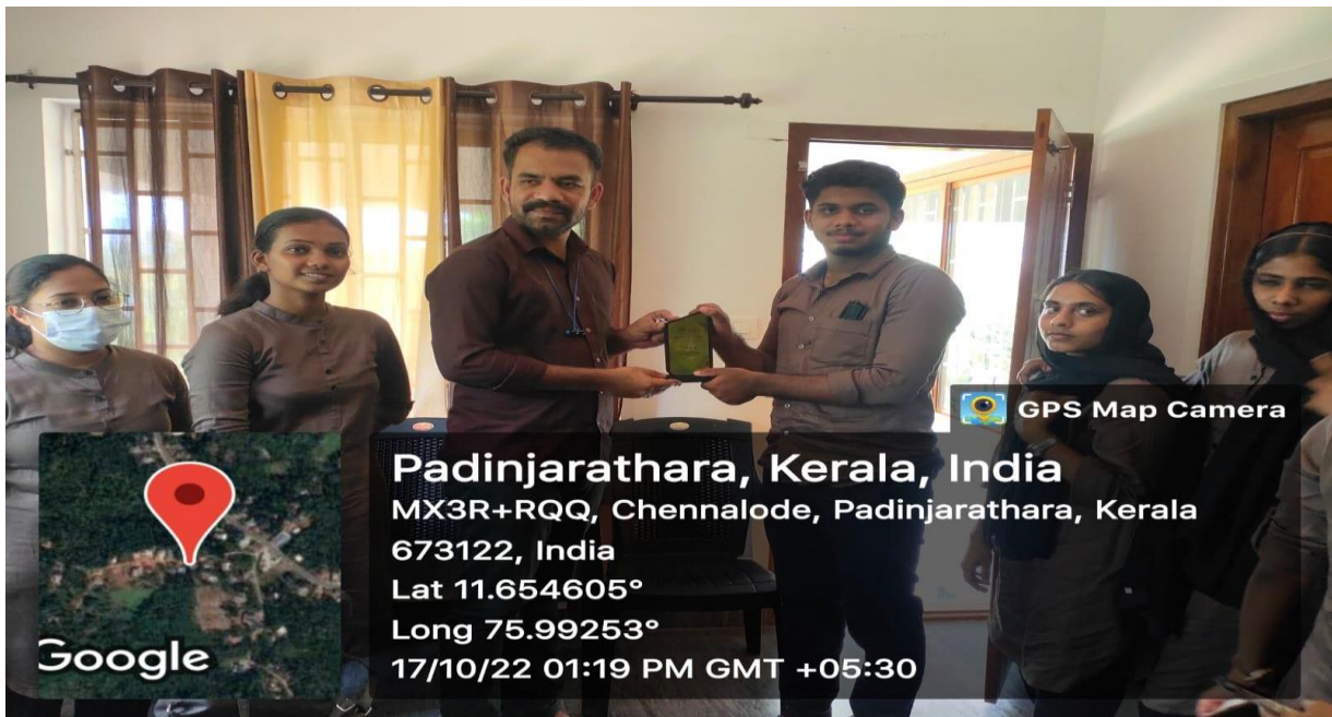
The Secretary, totem Resource Centre is receiving a momentum from the students of the Department of Social Work.