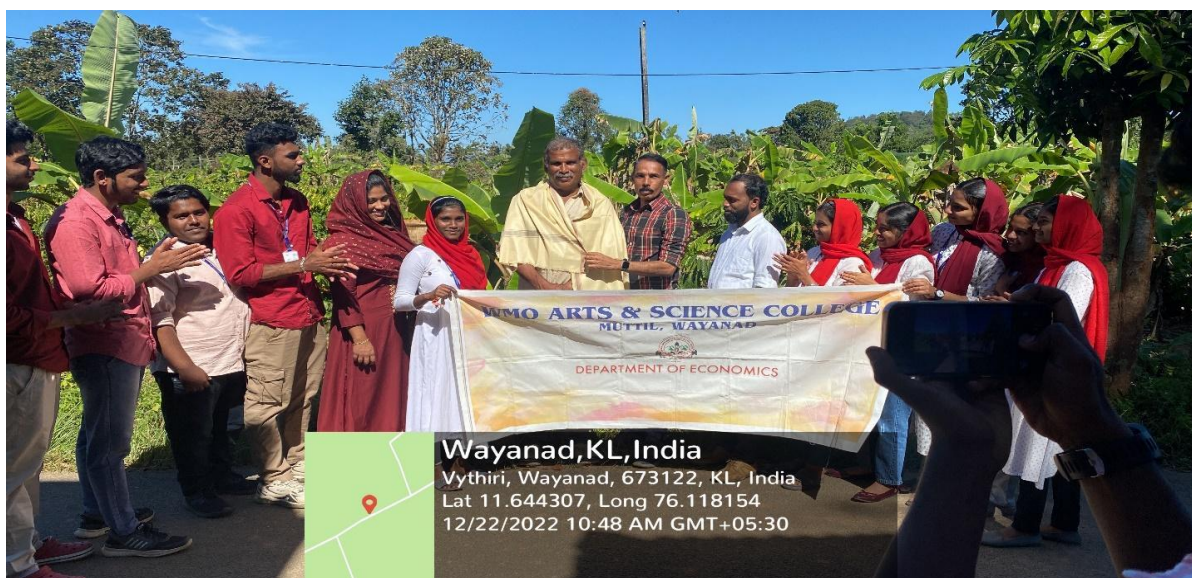
Photo Exhibition and Commemoration Programme on Pulwama Day