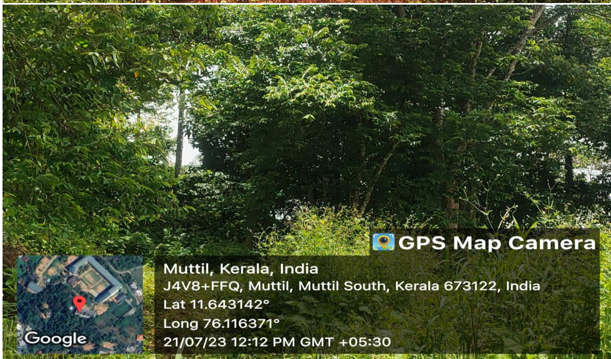
Fig-8: Community Forest

Principal W.M.O. Arts & Science College Muttill P.O., Wayanad