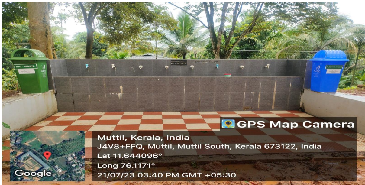
Fig-5: Waste Collection- Degradable and Non- Degradable