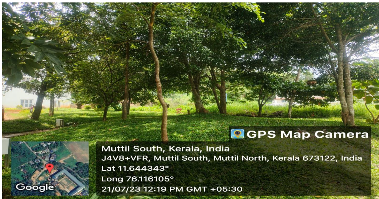
Fig-2: Photo graphs of Green Campus

Principal W.M.O. Arts & Science College Muttill P.O., Wayanad