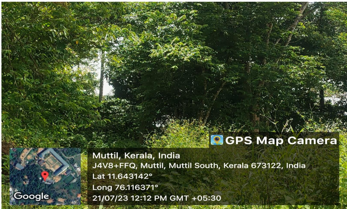
Fig-3: Green Campus

Principal W.M.O. Arts & Science College Muttill P.O., Wayanad