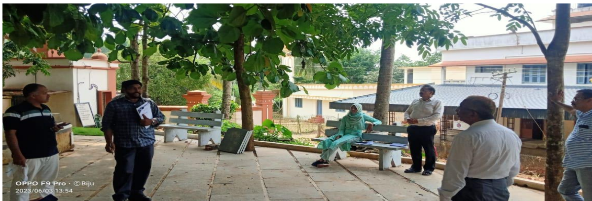
Fig-1: Clean and Barrier free environment.

Principal W.M.O. Arts & Science College Muttill P.O., Wayanad