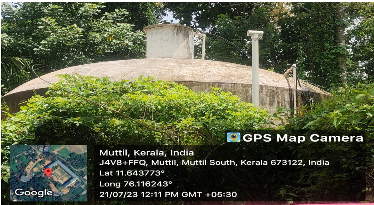
Fig-4: Water Conservation

Principal W.M.O. Arts & Science College Muttill P.O., Wayanad