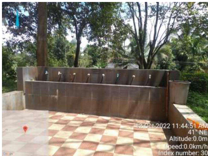
Figure-4: Hand washing area