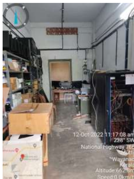
Figure-2: E Waste- Management.