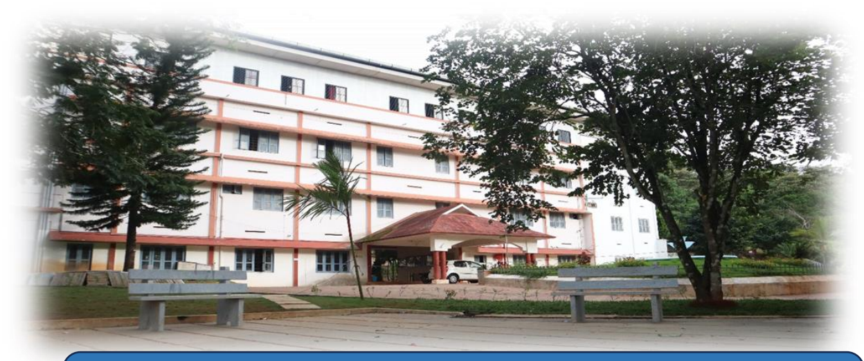
CRITERIA-7 7.1.3: Certificates of appreciation on Environmental activities