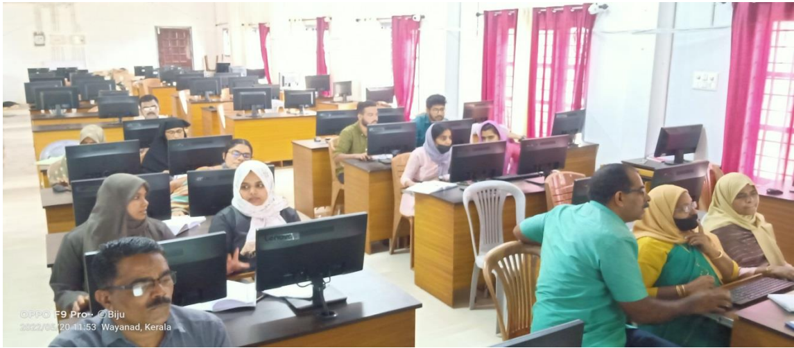
OPPO F9 Pro · 2022/01/20 11:53 Wayanad, Kerala