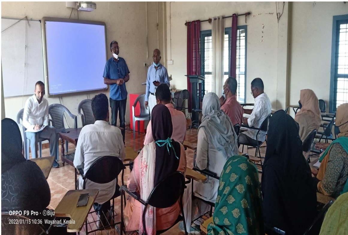
OPPO F9 Pro · ©Biju 2022/01/15 10:36 Wayanad, Kerala