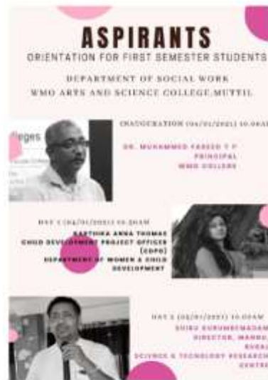
Poster of 'ASPIRANTS'