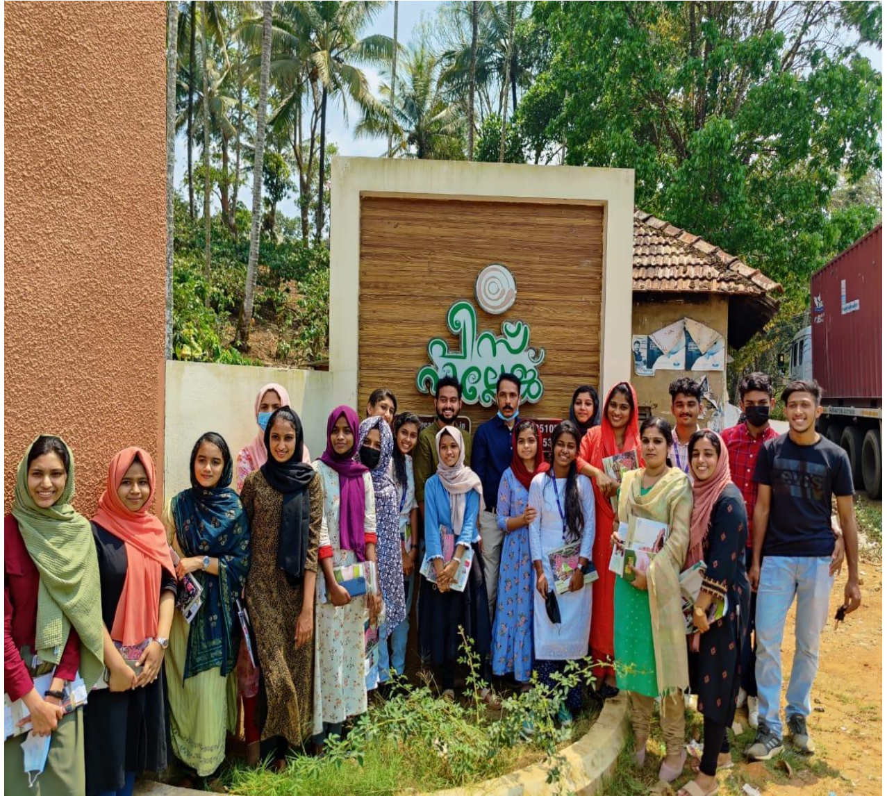
Students and Teachers in front of the Peace Village

Principal W.M.O. Arts & Science College Muttill P.O., Wayanad