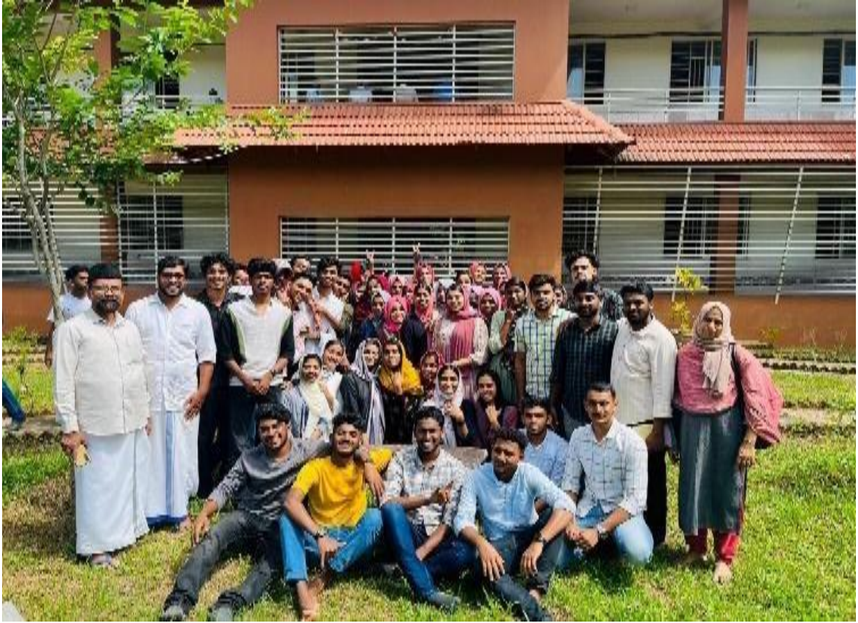
Students and Teachers at the Peace Village

Principal W.M.O. Arts & Science College Muttill P.O., Wayanad