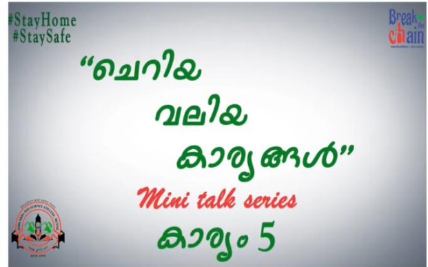
നിങ്ങളുടെ ചിന്തകൾക്ക് കാതോർക്കൂ | Track & Analyse Your Thoughts | Mini Talk Series - Talk 5