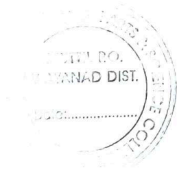
Principal W.M.O. Arts & Science College Muttil P.O., Wayanad-673122

Regular communication with the selected students is crucial to inform them of their scholarship percentage and provide any necessary instructions or additional documentation required to receive the financial assistance. By implementing the committee's decision, the educational support scheme can effectively provide financial relief to orphanage inmates and other eligible students, promoting equal access to education and supporting their academic journeys.