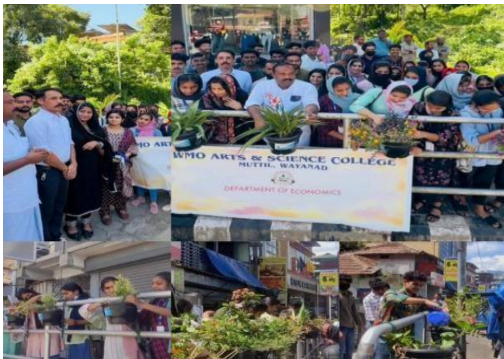
Participants with the Municipality Chairman

Principal W.M.O. Arts & Science College Muttil P.O., Wayanad